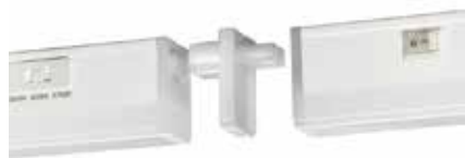
Simple Coupling System